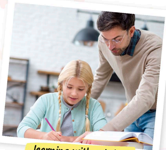
learning with a tutor