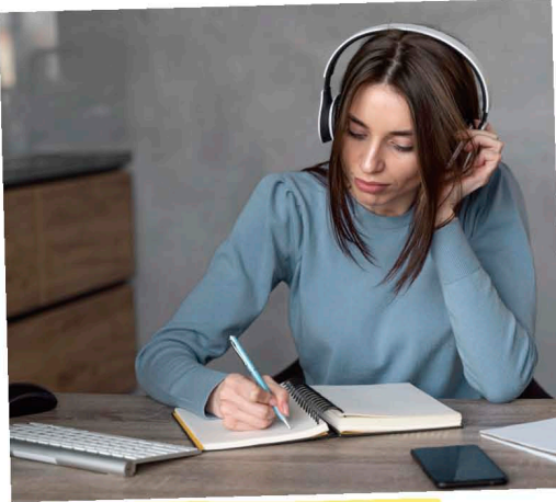
learning on your own

Compare the pictures and state the advantages of learning languages in these ways. Which way do you prefer and why?