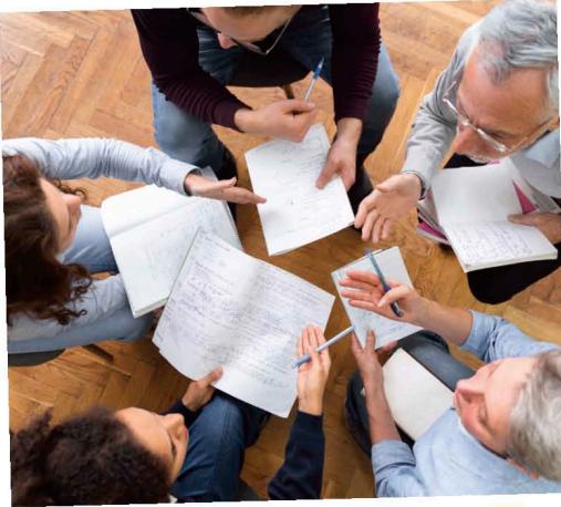
learning in groups