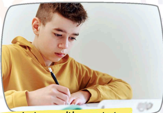
A story writing contest