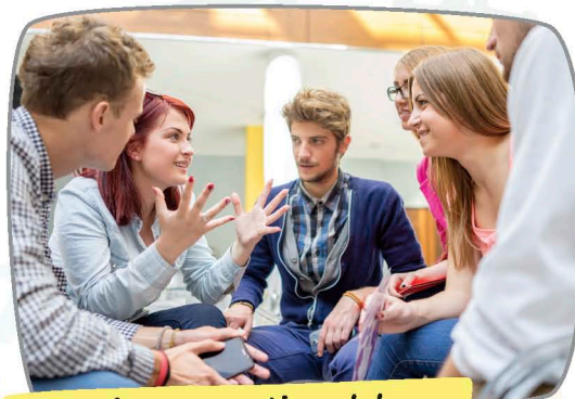
A conversation club