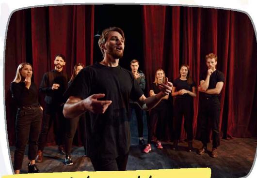
A drama club