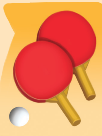
ping pong /pɪŋ pɒŋ/