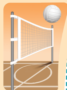
volleyball /ˈvɒlibɔːl/ /ˈvɑːlibɔːl/